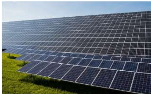
Tata Power Renewable used around 6.56 lakh modules for the solar project

Celeb: Saushar Khan's Stylish Ethnic Looks 11 Slides